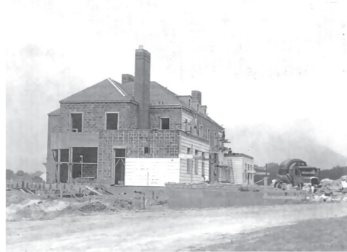
Under construction in 1937

To learn more, I encourage you to read my review of McCullagh's biography here: markhamward1.ca/big-men-feared-thornhills-george-mccullagh