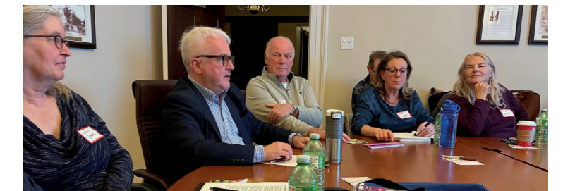
At the meeting

Note: The city's "Use of Corporate Resources for Election Purposes Policy" prohibits members of Council from distributing newsletters (printed and/or electronic) and from hosting community information meetings during the municipal election period, May 1 to October 26, 2026.