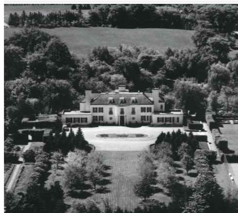
Looking south toward John Street, circa 1950