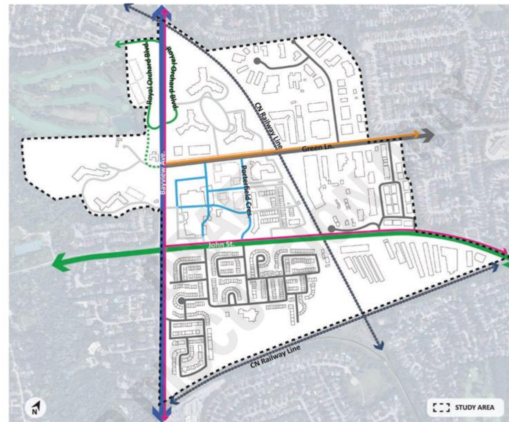
FIGURE 6. STREET AND BLOCK LAYOUT MAP