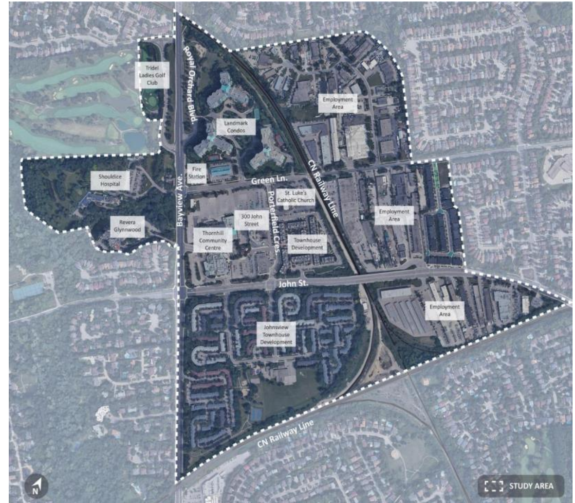
Bayview and John Area