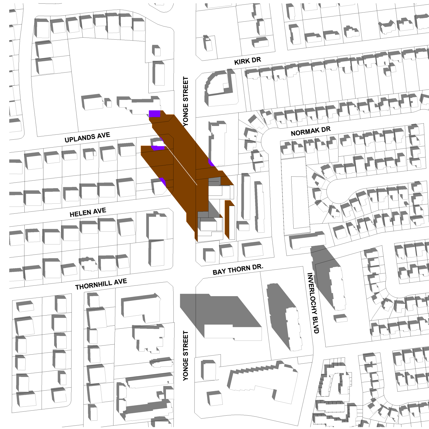
2 SEPTEMBER 21 - 1118 AM A5.3 1: 3000