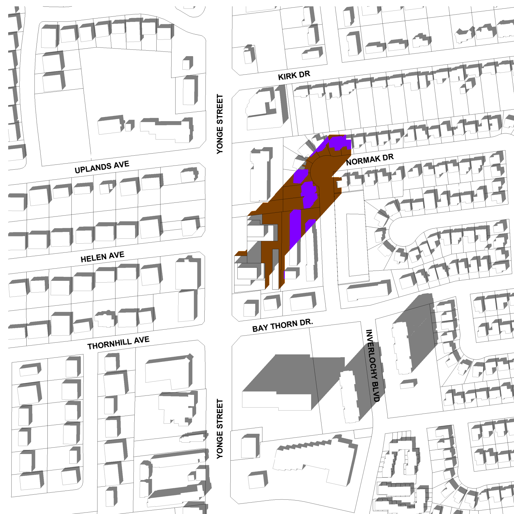
4 SEPTEMBER 21 - 1518 PM A5.3 1: 3000