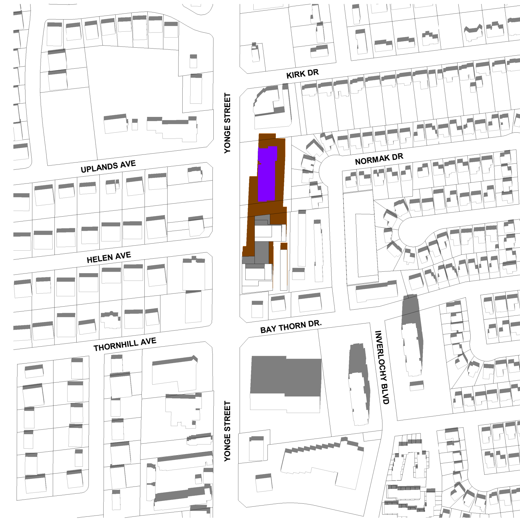
3 SEPTEMBER 21 - 1318 PM A5.3 1: 3000