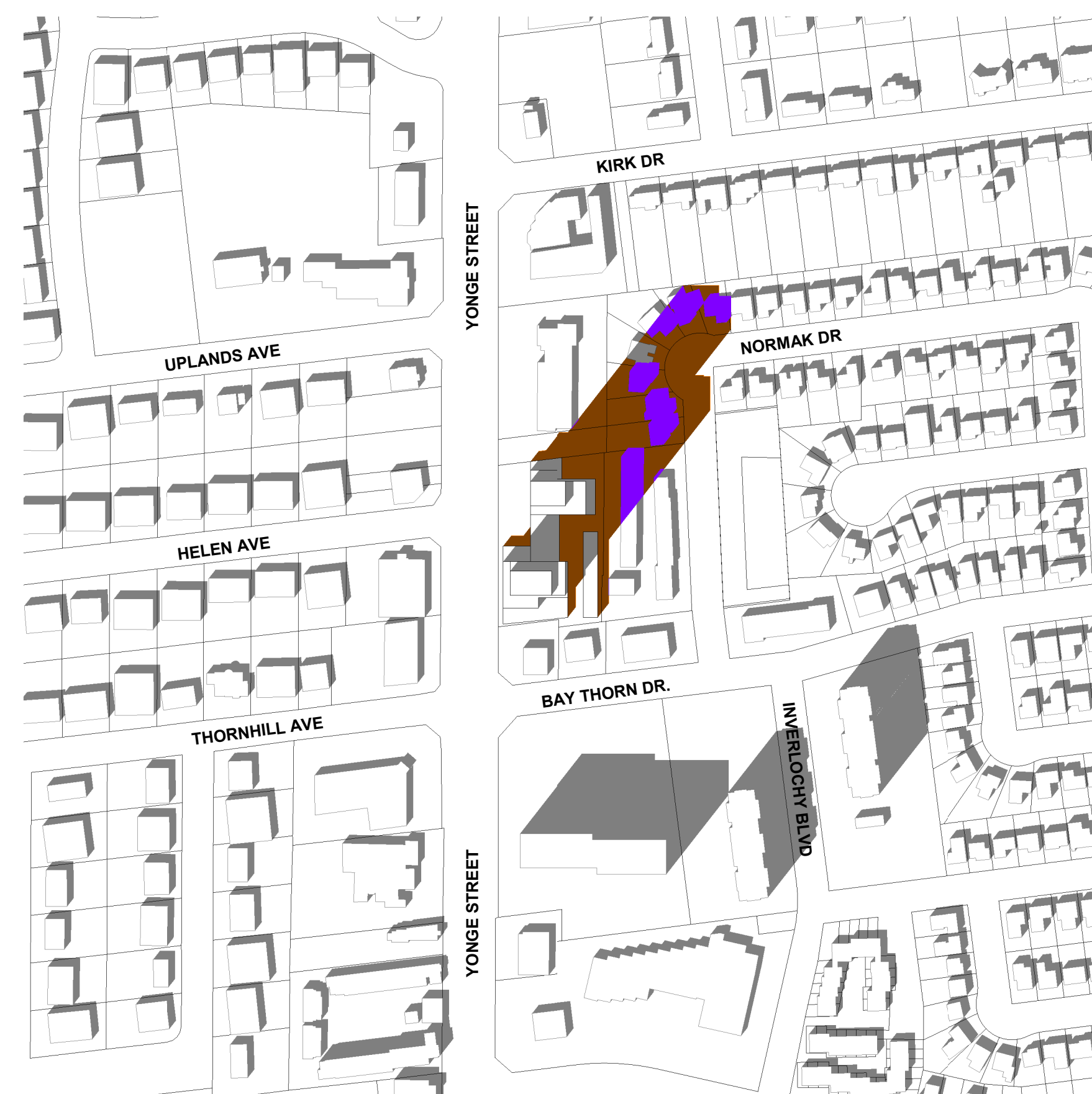
5 MARCH 21 - 1718 PM A5.1 1:3000