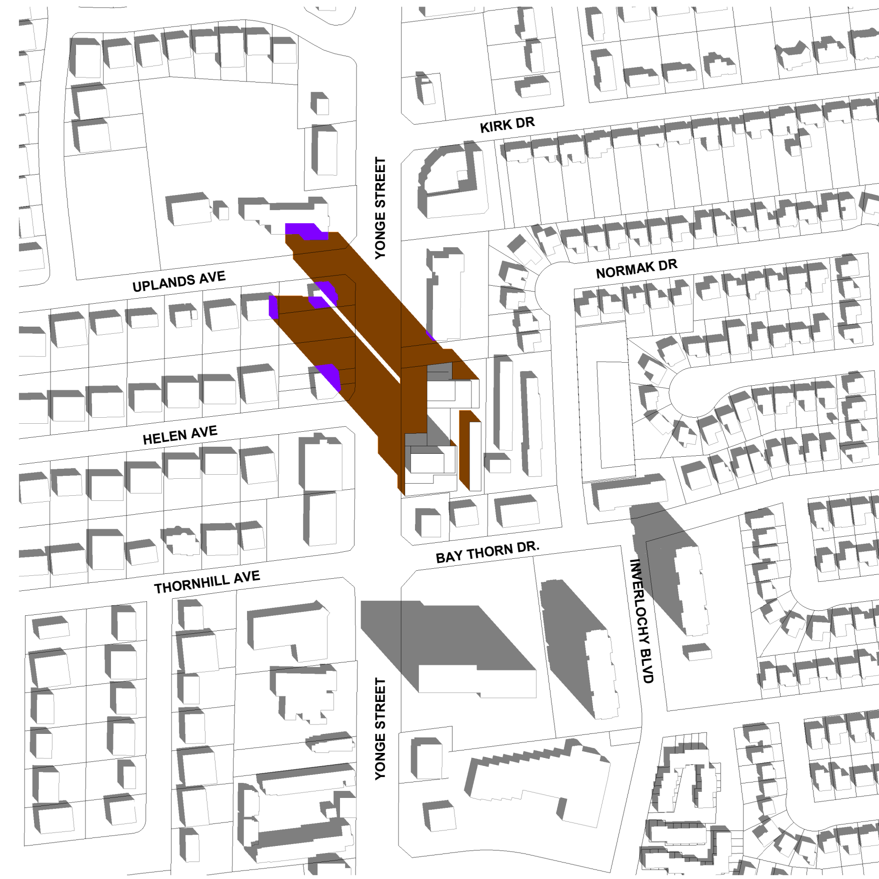
2 MARCH 21 - 1118 AM A5.1 1:3000