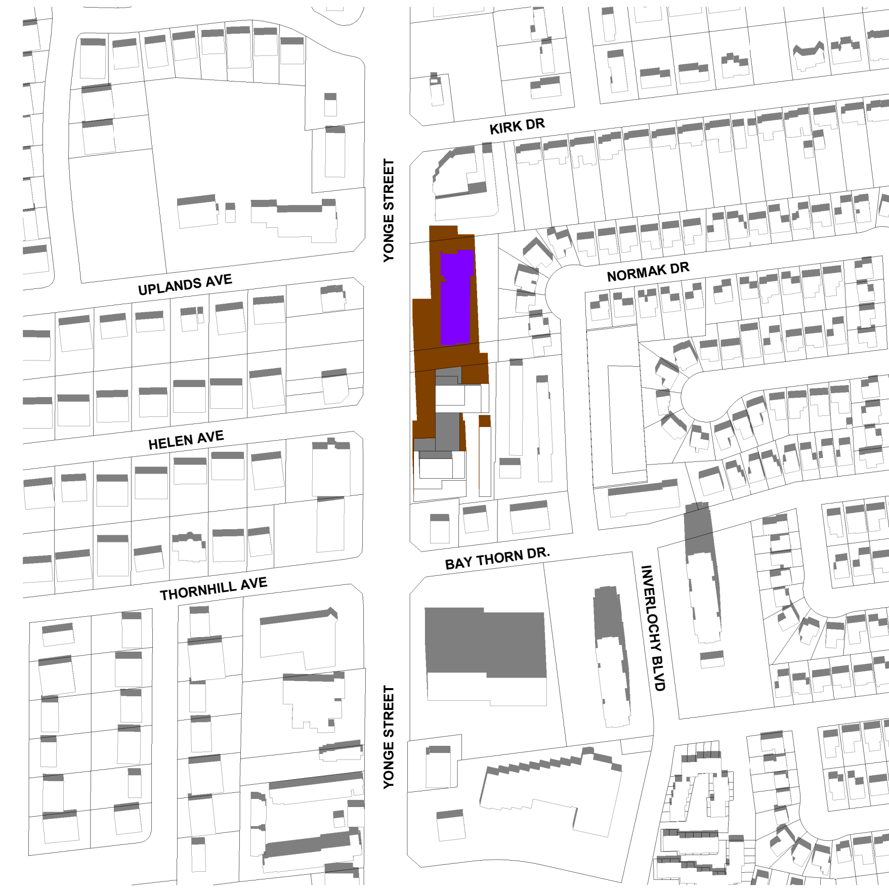
3 MARCH 21 - 1318 PM A5.1 1:3000