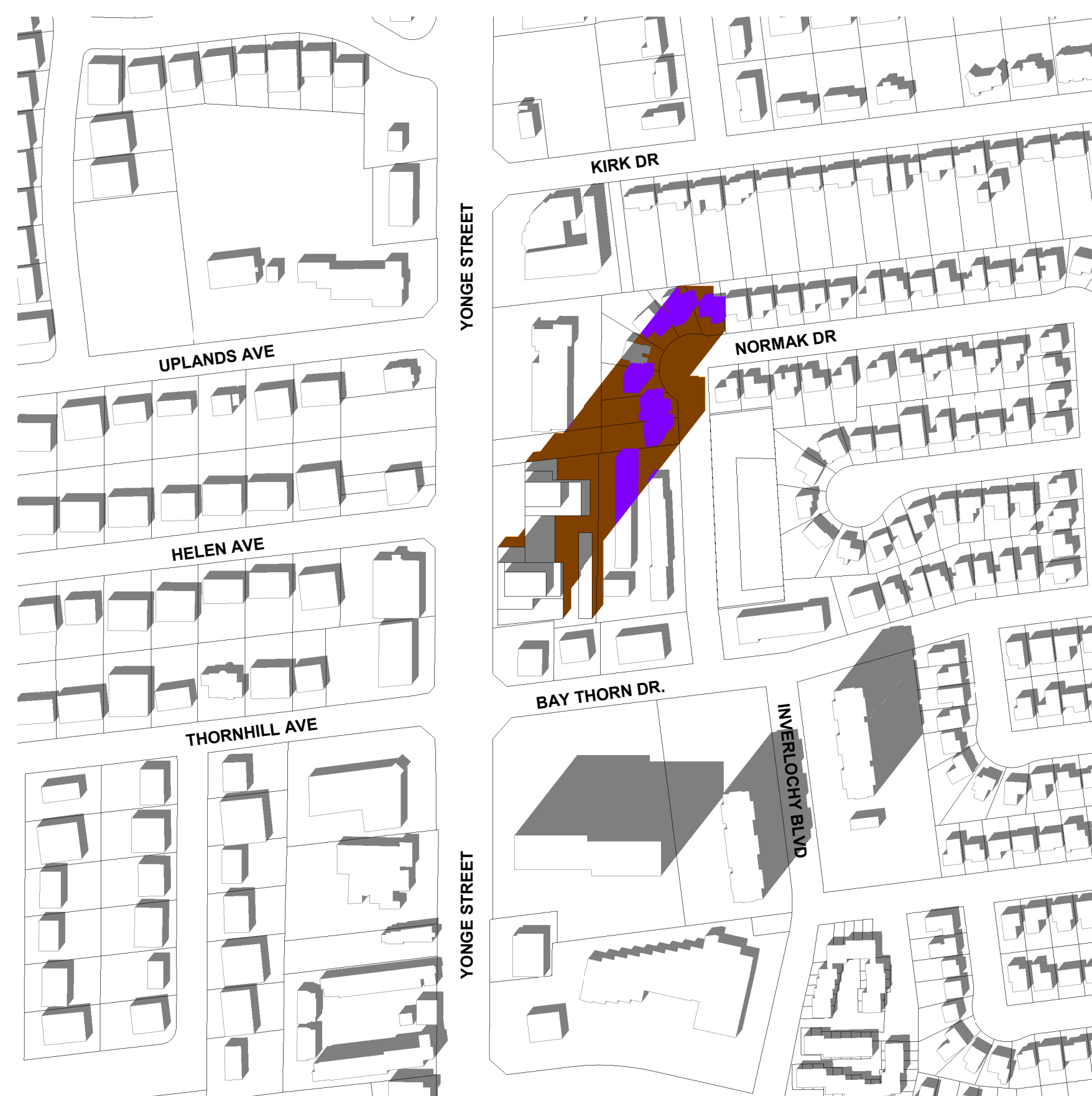
4 MARCH 21 - 1518 PM A5.1 1:3000